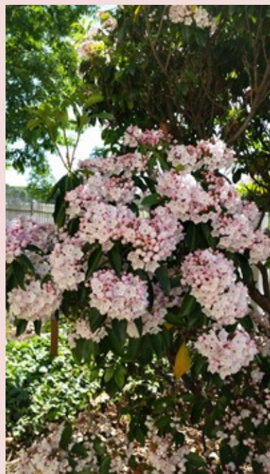
The Gardens In May