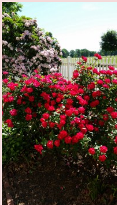
Mountain Laurel and Roses in bloom at Laurel Hill Mansion.